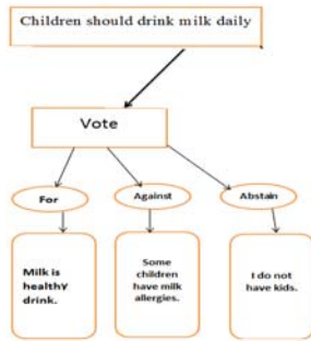
Figure 1: Example of Single-Derivation.

The diagram in Figure 1 is an example of single-derivation.