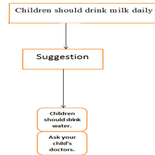
Figure 3: Example of the single-choice.

Also, each class of derivation numbers (single derivation and/or multiple derivations) can be characterized based on the number of choices.