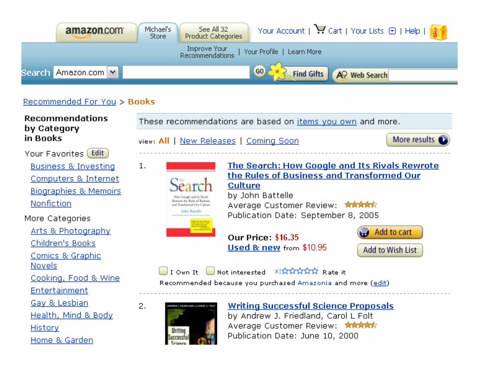
Fig. 10.1. Book recommendations by Amazon.com.

In rule-based recommendation systems, the recommendation system has rules to recommend other products based on the user history. For example, a system may contain a rule that recommends the sequel to a book or movie to people who have purchased the early item in the series. Another rule might recommend a new CD by an artist to users that purchased earlier CDs by that artist. Rule-based systems may capture several common reasons for making recommendations, but they do not offer the same detailed personalized recommendations that are available with other recommendation systems.